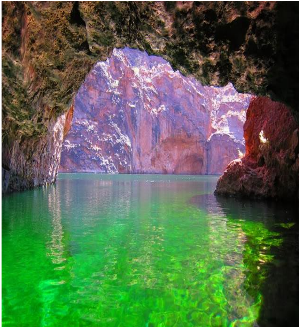
Emerald Cave, Willow Beach, Arizona